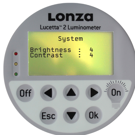
Figure 14: Display for adjusting display brightness and contrast