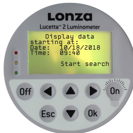
Figure 7: Example of time and date selection to view measurements

To change the date displayed, use arrow button ▲ to select DATE and press OK. Use arrow buttons ►◀ to select day, month or year. Depending on the selected country for the date format (for more details see section 6.0), the format is MM/DD/YYYY (USA) or DD.MM.YYYY (Europe). The flashing cursor indicates the number to be adjusted (Figure 7). To change the time displayed, select TIME to change hours and minutes as described for changing the date.