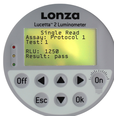
Figure 6. Example of a Single Read measurement screen. The result of the measurement is 1250 RLU.