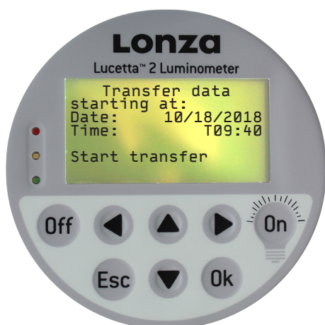
Figure 9: Example of transfer result screen