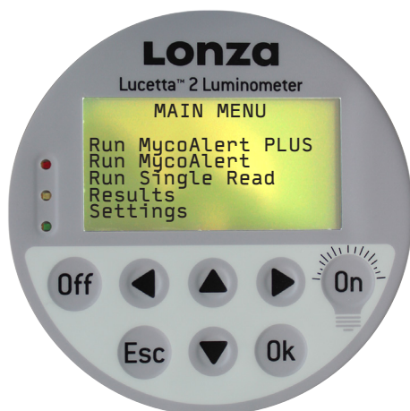
Figure 4. Main menu of the Lucetta™ 2 Luminometer.

On the front face of the Lucetta™ 2 Luminometer is an LCD display showing the menus, the measurement parameters, and the measurement results. To open a submenu from the main menu (Figure 4) move the gray select bar up and down by using the two arrow buttons ▲▼. Once at the desired position, press OK to activate that choice.