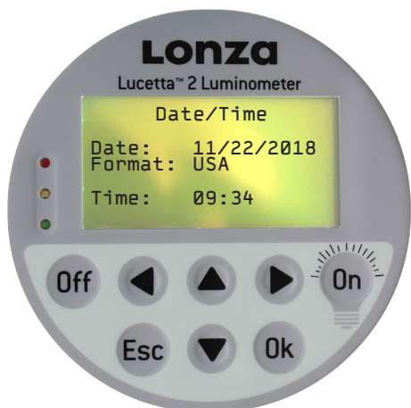
Figure 13: Display for setting date and time