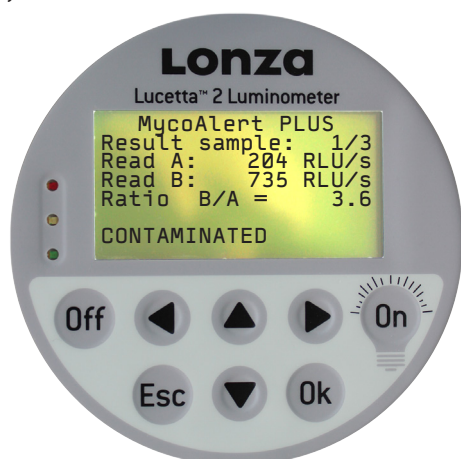
Figure 5. Example of a MycoAlert™ PLUS Measurement screen. In this case, CONTAMINATED is displayed as the B/A ratio is 3.6.