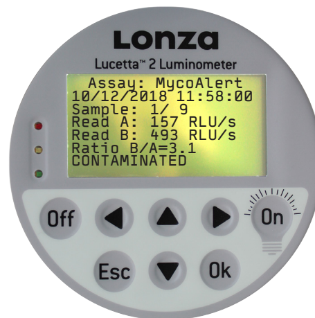
Figure 8: Example of a logged measurement

Use arrow button down ▼ to view all measurements.