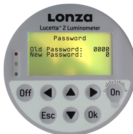
Figure 11: Display for setting a password