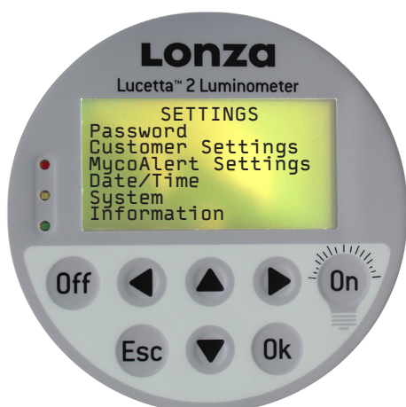
Figure 10: Submenu SETTINGS

Via the submenu SETTINGS (Figure 10) the Lucetta™ 2 Luminometer allows the setting of a user password, creation of customized protocols in Single Read mode and date and time setting options. Display settings such as brightness and contrast can also be optimized here. Instrument settings for MycoAlert measurements are password-protected and can only be accessed by Lonza service personnel. Software version and serial number of the luminometer can also be reviewed in the submenu.