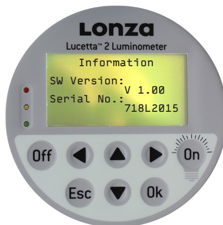
Figure 15: Display for software version and serial number information