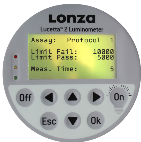
Figure 12: Display for setting Single Read parameters