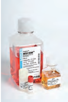
Clonetics™ and Poietics™ Primary Cells and Media