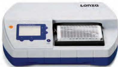
Nucleofector™ 96-well Shuttle™ Device

Transfection performance data is based upon both data from Lonza R&D and on customer data. If no transfection data are available, we have listed the Nucleofector™ Kit recommended for optimization of this cell type. Transfection performance values are validated in combination with Clonetics™ and Poietics™ Cells and Media only when marked with an asterisk [*].