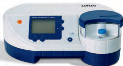
Nucleofector™ 2b Device

Combining high quality primary cells, media and supplements with the leading transfection technology for primary cells significantly reduces validation and optimization tasks at every step, as well as eliminating dissection and cell isolation – meaning that your efforts can be focused on getting the best possible assay data.