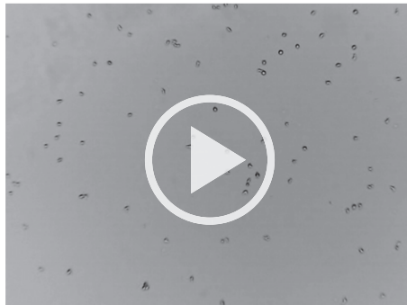
The video of undirected migration of NK-92 recorded with the CytoSMART™ Lux 10X Device (Snapshot interval: 1 minute) can be watched online at www.lonza.com/cytosmart .

We used the CytoSMART™ System as an affordable and easy-to-use system to create time lapse recordings of the undirected migration of NK cells under the influence of physiological and pathophysiological (equal to normal weight and obese individuals) concentrations of leptin. The recorded videos have been analyzed by the Tracking Tool™ PRO cell tracking software (Gradientech, Sweden) regarding the average migration speed of the cells.