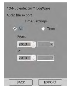
Figure 8: Open audit trail file