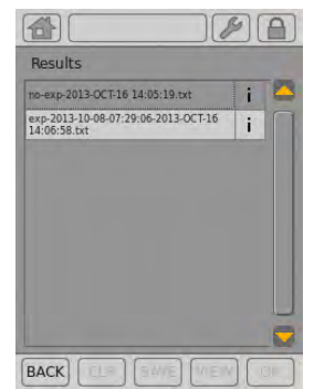
Figure 10: Result file list

The "Lonza Programs" menu shows the currently installed version of programs and cell type codes. A new program list can be uploaded via this menu by navigating to the appropriate update file on a USB stick plugged into the 4D-Nucleofector<sup>™</sup> System. The program update file is always named "4D-Nucleofector-PV.pd". The most recent list of Lonza programs will be always installed during a regular firmware update.