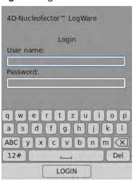
Figure 2: Login screen