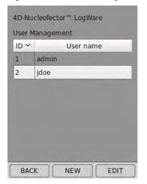
Figure 5: Generating a new user