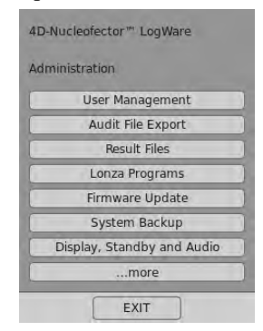
Figure 3: Menu "Administration"

Leave the administrator settings menu by pressing "EXIT". Now standard users can log in.