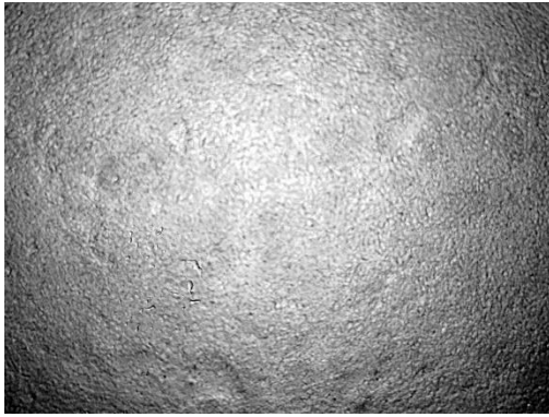
Figure 2. SAEC morphology (4X) just before airlift; 100% confluence in S-ALI™ Growth Medium